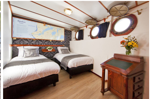
Premium twin cabin