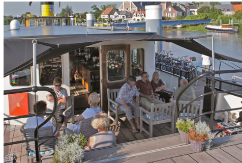
Upper Deck Lounge