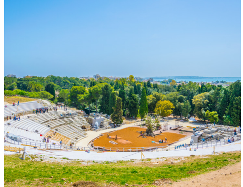
Ruins of the Greek theatre of Syracuse