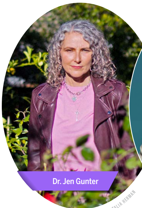
Dr. Jen Gunter

Between these two events, registration topped 1,600 and saw almost 350 video views after the events.