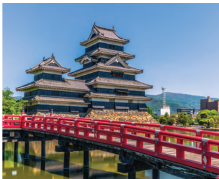
Matsumoto Castle, Nagano

Explore Sannomachi Street in Takayama's old town, engaging in a sake tasting session and visiting the Matsuri no Mori Museum, which exhibits the rich heritage of the Takayama Festival. Continue to Matsumoto to view the striking Matsumoto Castle, distinguished by its black exterior and nicknamed "Crow Castle." This historic site stands as one of Japan's most important castles and is the oldest existing five-structure/six-story castle in the country.