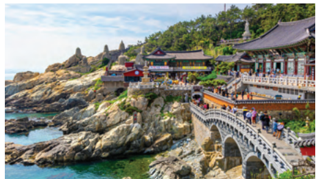
Haedong Yonggungsa Temple, Busan

Head to Busan and begin your exploration at Songdo Skywalk, a 365-meter promenade offering scenic views over the water from Songdo Beach. Next, visit the 120-meter-high Busan Tower, an emblematic symbol of the city. Explore Jagalchi Market, Korea's largest seafood market, bustling with vibrant stalls and fresh catches. Continue to Huinnyeoul Culture Village, set on Yeongdo's cliffs, offering quaint coastal charm. The journey culminates at Gamcheon Culture Village, known for its colorful houses and winding alleys, artistically set against the hillside.