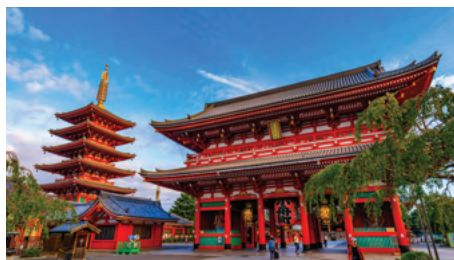
Asakusa Kannon Temple, Tokyo

Start the day visiting Tokyo's serene Meiji Jingu Shrine, steeped in tranquility and tradition. Dive into the culinary world with a sushi-making session, then wander through the lively stalls of Tsukiji Outer Market, famous for its fresh fare and rich history. Continue to the venerable Asakusa Kannon Temple, a beacon of the Edo period, and meander along the Nakamise Shopping Arcade, where a variety of traditional garments, handicrafts, and snacks invite exploration.