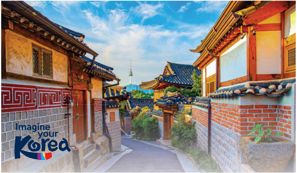
Bukchon Hanok Village, Seoul