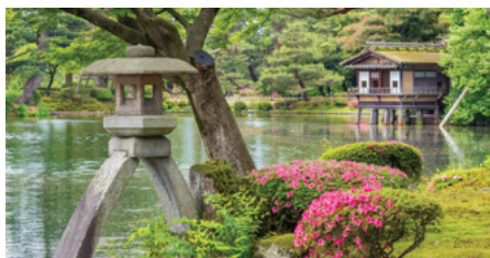
Kenrokuen Garden, Kanazawa