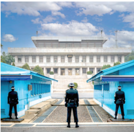
Joint Security Area in DMZ

Journey to the Korean Demilitarized Zone (DMZ), the stark border between North and South Korea. Visit key sites including Imjingak Park, the symbolic Freedom Bridge, and the clandestine Third Infiltration Tunnel. Gain unique perspectives of North Korea from the Dora Observatory and explore Dorasan Station, the northernmost railway station in South Korea. After exploring these poignant and historic sites, return to the hotel for a leisurely evening or further personal exploration.