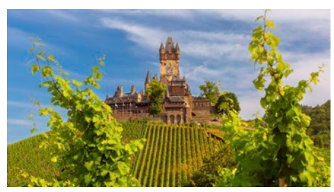
Top: Miltenberg | Above: Reichsburg Castle, Cochem