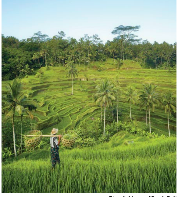
Rice field near Ubud, Bali

Join an enriching 12-night adventure to Southeast Asia, a land of stunning diversity. Begin in beautiful Bali, a treasure trove of cultural landmarks. Fly to Singapore and witness this modern city's fascinating attractions and neighborhoods. Unravel Bangkok's myriad layers found within its winding canals and opulent palaces and shrines. Venture beyond Bangkok to the early Siem capital of Ayutthaya before capping off the journey in Cambodia. Here, encounter the remarkable Angkor Wat and other ancient temples. Along the way, the region's welcoming locals share insights into their lives, cuisine and unique traditions.